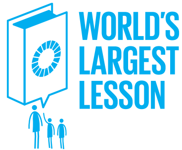
WORLD'S LARGEST LESSON