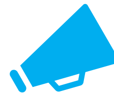
Youth Advocacy & Campaigning