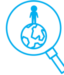
Make children a focus of environmental strategies